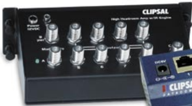
3 Input/8 Output Video Distribution Hub