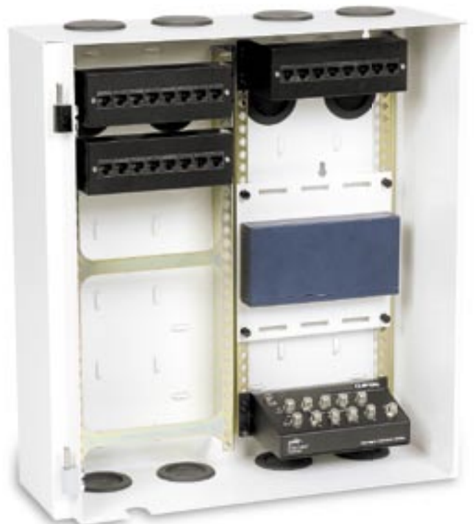
StarServe Home Office: Three video sources capable of infra-red control (VCR, Pay TV, DVD or Free to Air), a Data network and telephone services