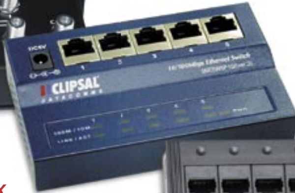
5 Port Ethernet Data Networking Hub