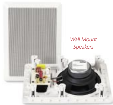
Wall Mount Speakers

Any room in the home can be wired for sound.