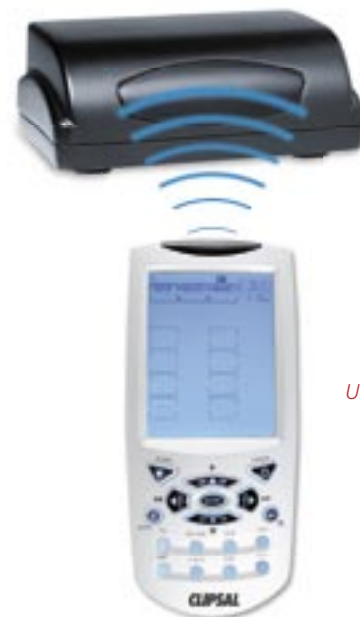
Infrared Distribution System

The tear-off page at the back of this brochure is a room-by-room guide to help you with what you might need. Consider what services you would like in each respective room of your home and tick the appropriate box in the Digital Services Planner.