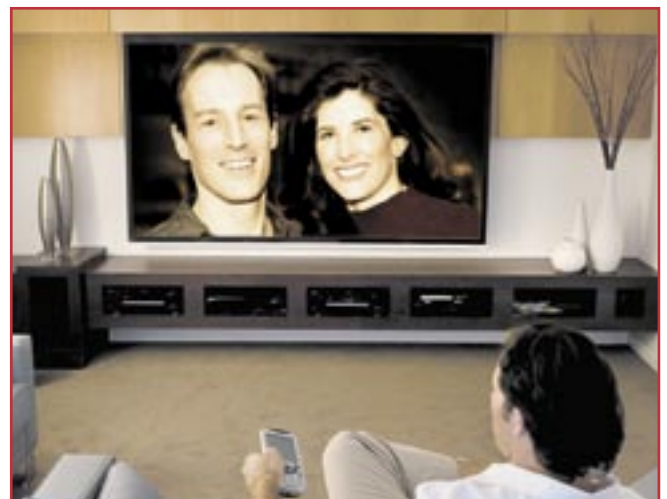
See who's at the front door without leaving your chair