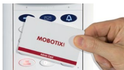
Hold in front for five seconds