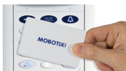
Hold briefly in front